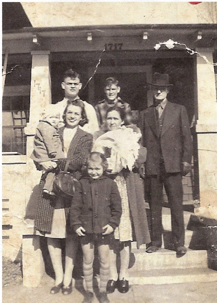
Taken in front of the house at 1717 Alexander.